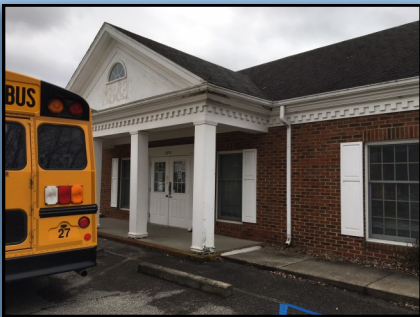
Apache Run Center