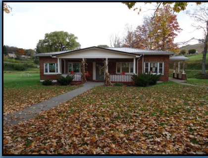
Camp Joy Center